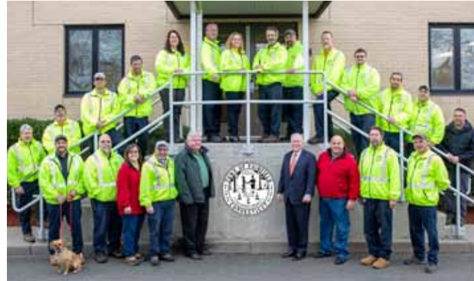
ENERGY MANAGEMENT ACHIEVEMENT AWARD Town of Fairfield, Fairfield, CT