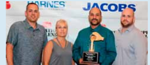
OPERATIONS CHALLENGE DIVISION II— 1ST PLACE PROCESS CONTROL AND 1ST PLACE LAB* Ocean State Alliance, RI