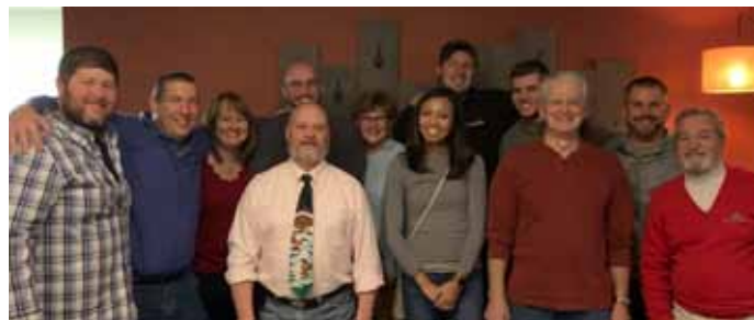
WASTEWATER UTILITY AWARD York Sewer District, York Beach, ME