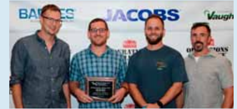
OPERATIONS CHALLENGE DIVISION II— 2ND PLACE PROCESS CONTROL* Franken Foggers, CT