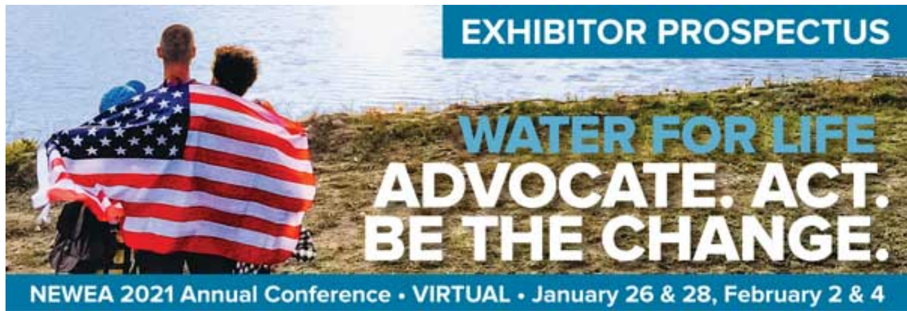
EXHIBIT AND SPONSOR OPPORTUNITY

The New England Water Environment Association (NEWEA) invites you to support its 2021 Virtual Annual Conference & Exhibit (#NEWEA21) that will be held January 26 & 28, 2021 and February 2 & 4, 2021. The conference provides an opportunity for professional exchange of information and state-of-the-art concepts in wastewater treatment and other water environment issues.