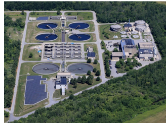
ENERGY MANAGEMENT ACHIEVEMENT AWARD Greater Lawrence Sanitary District North Andover, MA