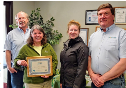
COMMITTEE AWARD GREEN STEPS RMI