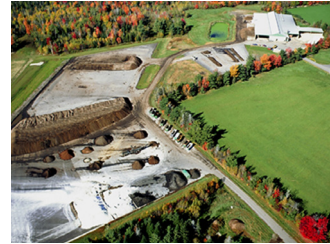
BIOSOLIDS MANAGEMENT AWARD Hawk Ridge Compost Facility Hermon, ME