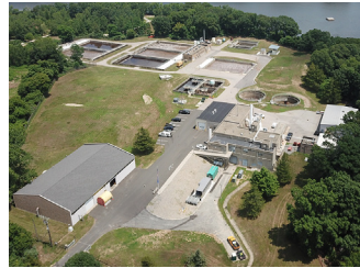
WASTEWATER UTILITY AWARD Montville WPCA Uncasville, CT